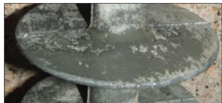
A loss of Hydrophobicity after several years of service is indicated by the 'wetting out' of the surface, as seen on this polymer insulator.

Until now hydrophobic properties have been found to be severely reduced, even lost, well short of an insulators required service life. Compounds or additives used within voltage insulators, for example in Polymer Composite insulators, are designed to migrate to the surface to provide the hydrophobicity. This migratory process means the hydrophobicity gradually leaches out, and is washed away through years of natural weathering. The result is a surface that will eventually wet out.