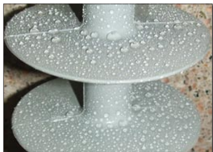
Hydrophobicity demonstrated by beading on the surface of a new polymer insulator.

W ith growing pollution levels and an ever growing coastal population, hydrophobicity (water repellence) of insulators has become an important consideration for equipment specifiers. An insulator with hydrophobic properties causes water to bead on its surface and roll off assisting pollution to freely wash away rather than forming a continuous wet sheet or zone and combining with pollutants to form a conductive film. The hydrophobic effect helps to reduce discharge activity and maintenance requirements as well as decreasing the probability of flashover. These are properties that the ideal insulator possesses.