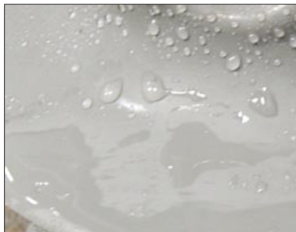
After accelerated surface ageing on the shed of this insulator manufactured from a standard cycloaliphatic epoxy resin, 'wet zones' begin to form on the surface.

Field-applied silicone coating is another alternative providing surface hydrophobicity, however this is at additional cost and often with less long term weathering performance.