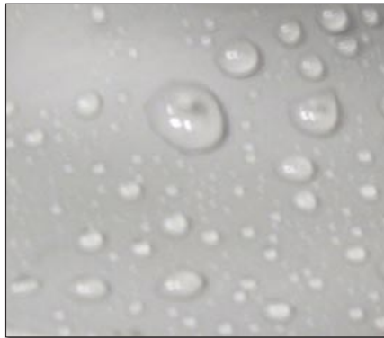
This PH-CEP insulator has been subjected to the same surface ageing. The hydrophobic properties have been retained as seen by the absence of wet zones and high degree of surface tension between the water droplets on the PH-CEP insulator.

Following years of extensive research and continuous development, EMC Pacific is proud to be able to provide a solution. In November 2007 our plant became 'manufacture ready' to offer outdoor line insulators, station post insulators and transformer bushings in EMC Pacific's revolutionary new 'Permanent Hydrophobic Cycloaliphatic Epoxy Resin' (PH-CEP).