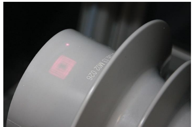
Laser Engraving example