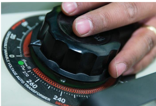
Partial Discharge Testing