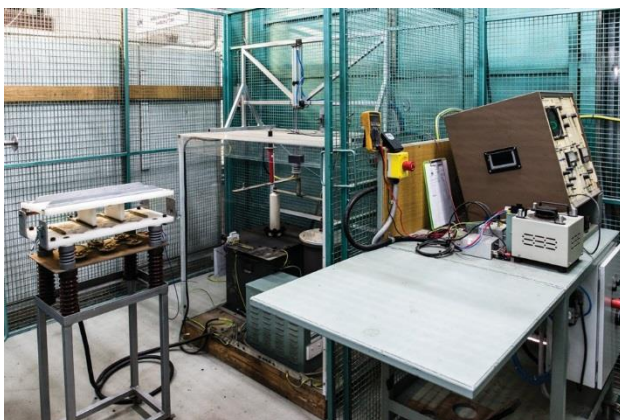
Partial Discharge Testing